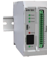
NEW SERIES: BioProTT™ FlowMCP-a