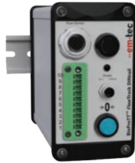
EXISTING SERIES: BioProTT™ FlowTrack DINrail